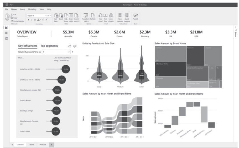
Figure 1 Microsoft Power BI dashboard example

conducted on healthcare providers there was only a weak connection between the use of Business Intelligence Systems and patient health outcomes (Isazad et. al. 2019). This shows that most organizations don't take the integration of BI systems far enough. The systems are mainly considered administrative tools. The BI use cases in the manufacturing industry are lot more self-evident, but there are no technical limitation to pre-